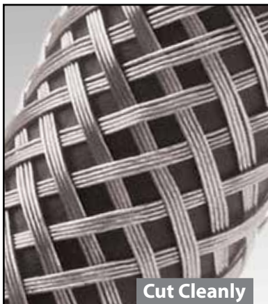
Cut Cleanly Shears