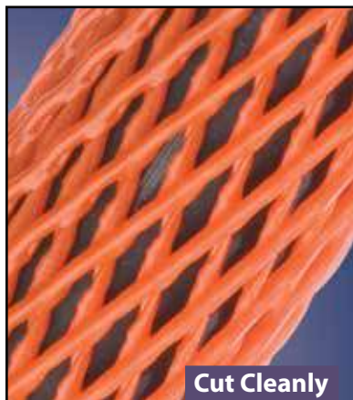
Cut Cleanly Scissors